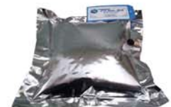
MLB Sampling Bag