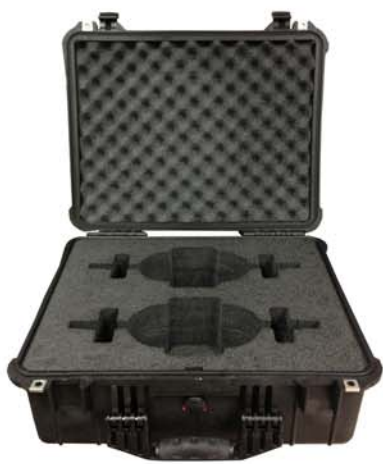
Rugged Shipping Case